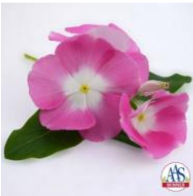
Vinca Pink Halo

Two varieties of Vinca have been recognized as 2017 AAS National winners. Vinca Mega Bloom Orchid Halo is one of a new series of Vinca bred to withstand heat and humidity without succumbing to disease. Orchid Halo produces huge bright rich purple blossoms with a wide white eye creating a striking look for the garden, even from a distance. Plants maintain a nice, dense habit with flowers staying on top of the foliage for full flower power color. Vinca Mega Bloom Pink Halo produces huge soft pink blossoms with a wide white eye. These flowers present a striking look in the garden, even from a distance. Plants maintain a nice, dense habit with flowers staying on top of the foliage for full flower power color.