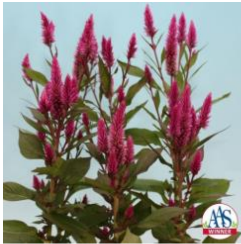
Asian Garden Celosia